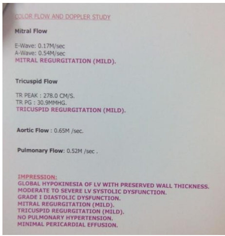
FIGURE – 2 Supportive report of peripartum cardiomyopathy